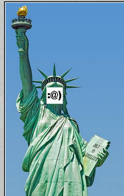
[danteinat's "statueofpignosity" for Essy]

• We are not a subset of the organizations that have created the Halo franchise. We are an independent entity, watching and observing their creations, in search of, supporting, and protecting the Truth that we believe they too are masking and protecting.