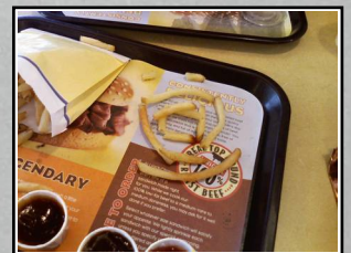
[xBLITZxKRIEGx's pignose sighting]

You now have a choice. If you choose to join us, we will be providing periodic updates in this same manner, containing our observations and discoveries, and reporting relevant news to our members. We may ask you to report findings and observations. We may ask for volunteers to appear in public as the face of the society. We may even ask you to take action against those who would abuse the knowledge we have dedicated to protect.