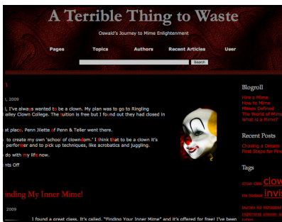
A Terrible Thing to Waste Blog