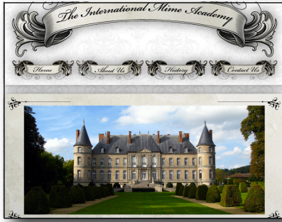
International Mime Academy Site